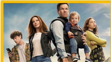
The Family Plan (Apple Studios) Starring Mark Wahlberg Client: Skydance

Starring Zac Efron & Jeremy Allen White Client: House Productions