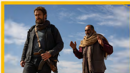
Kandahar (Capstone Pictures) Starring Gerard Butler Client: Thunder Road

Starring Miles Teller & Anna Taylor-Joy Client: Skydance