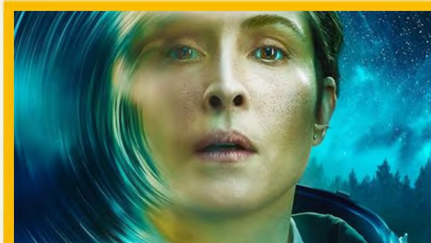
Constellation (Apple Studios) Starring Noomi Rapace Client: Turbine Studios