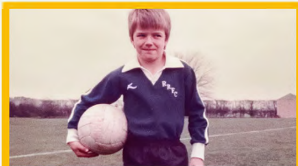
Beckham (Netflix) Client: Studio 99 / David Beckham