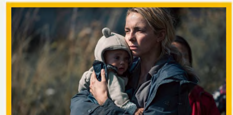
The End We Start From (Signature Entertainment) Starring Jodie Comer Clients: Sunnymarch & Hera Pictures

Starring Barry Keoghan Client: House Productions